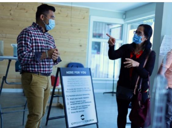
City Baptist Church is so thankful to be meeting again in person beginning in June!

One blessing the online format has allowed us, is that we have been able to hear from several guest speakers, and connect virtually with each of the missionaries that we support. Each of these unique opportunities has been encouraging and brought our church family closer together during this time.