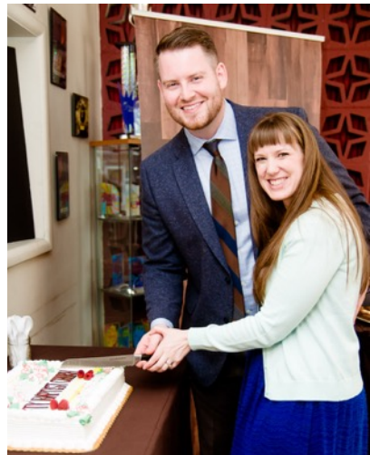
Cake makes it official!