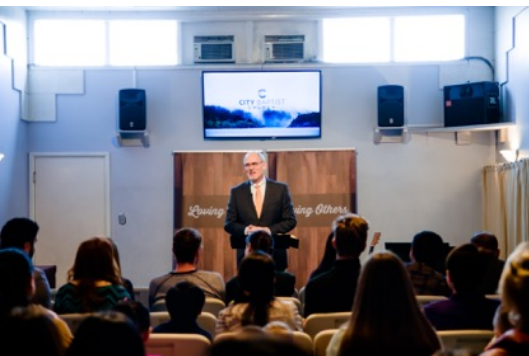
Charter and organizational service.