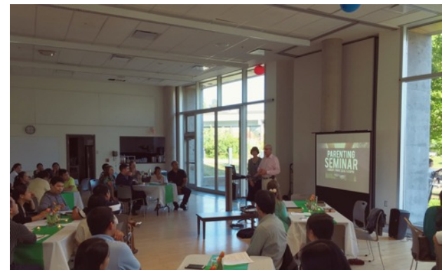
Parenting seminar on Mother's Day with Lions Gate Baptist Church.