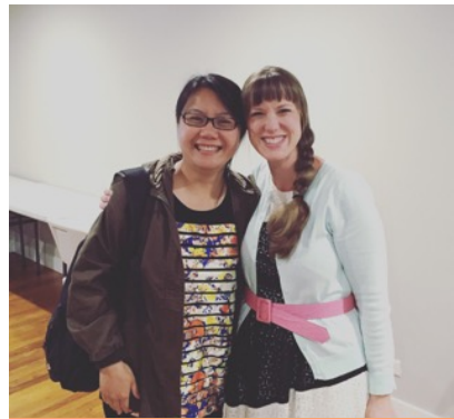
New life in Christ!

strong core of people for the future of City Baptist. We are looking forward to what He has for us in the future as we endeavour to reach our community with the life changing Gospel of Jesus Christ.