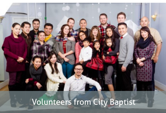
Volunteers from City Baptist

We are thankful for continued growth at City Baptist. Over the last two months we have seen steady numerical growth, with two Sundays with 39 people in attendance. Our Wednesday evening Bible Study has also grown as we have seen more Sunday attenders make the transition to attending both services during the week. It has been a blessing to see spiritual growth in new believers, as well as developing commitment and excitement in those who are attending each Sunday.