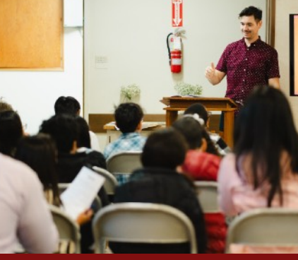
We are thankful for the many weekly Kid's Ministry volunteers.