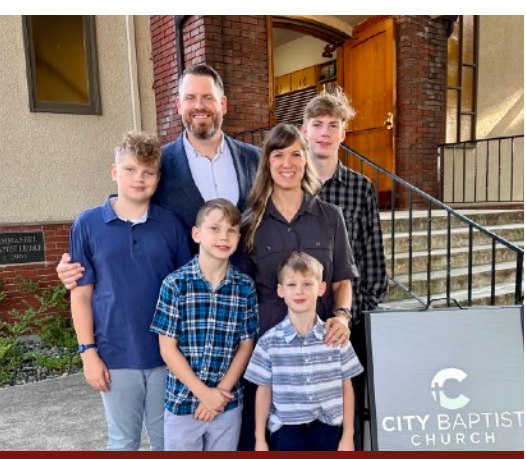
Our family before the 9th anniversary service.

month, without a place to move the church into. It was very challenging, and certainly a