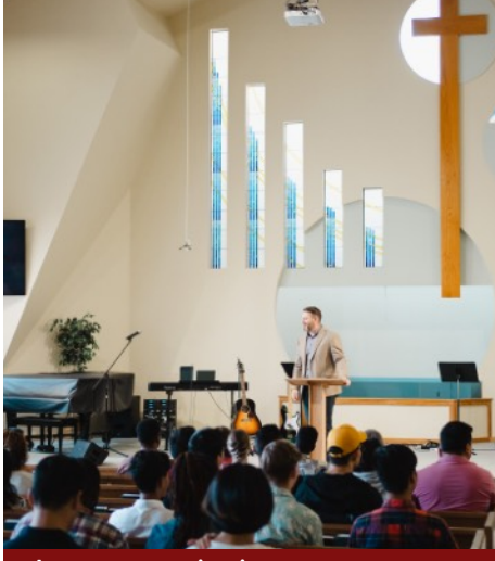
A recent service in our new location in Vancouver.

We did request that they reconsider, and if they would allow us an extension at least until the end of the year, but in the end, we were down to less than a