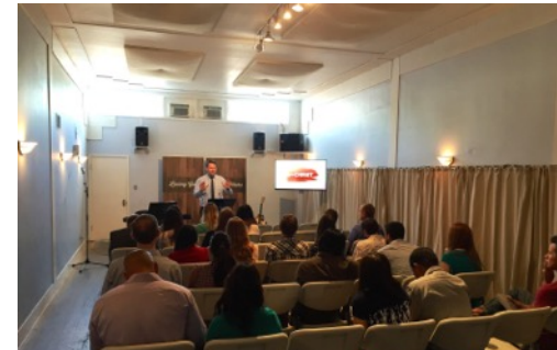
A recent service at City Baptist with 47 in attendance.

Well, September 5th arrived with a blue sky and God showing up in a big way. Despite our concerns and nervousness, we were blessed to see an incredible showing from the community for our event. To best of our estimations we had at least 300 people from the neighbourhood, and possibly even more than 350. God