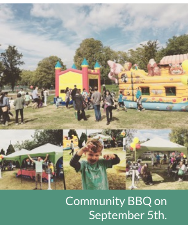
Community BBQ on September 5th.