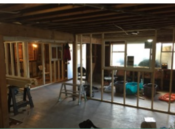
Moving forward on the basement renovation project.